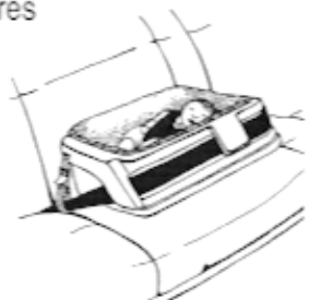
Angel Ride car bed

Car beds for infants whose medical condition requires that they lie flat. The most common conditions are oxygen desaturation, apnea, and bradycardia when seated semi-upright (see page 2).