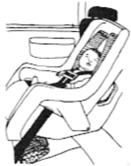
Convertible car seat facing the rear

Convertible restraints are used rear facing for an infant or toddler up to 30 to 45 pounds. They then can be faced forward (but not before age 1 AND over 20 pounds). If a convertible seat is to be used for a newborn, a harness is always preferable to a shield.